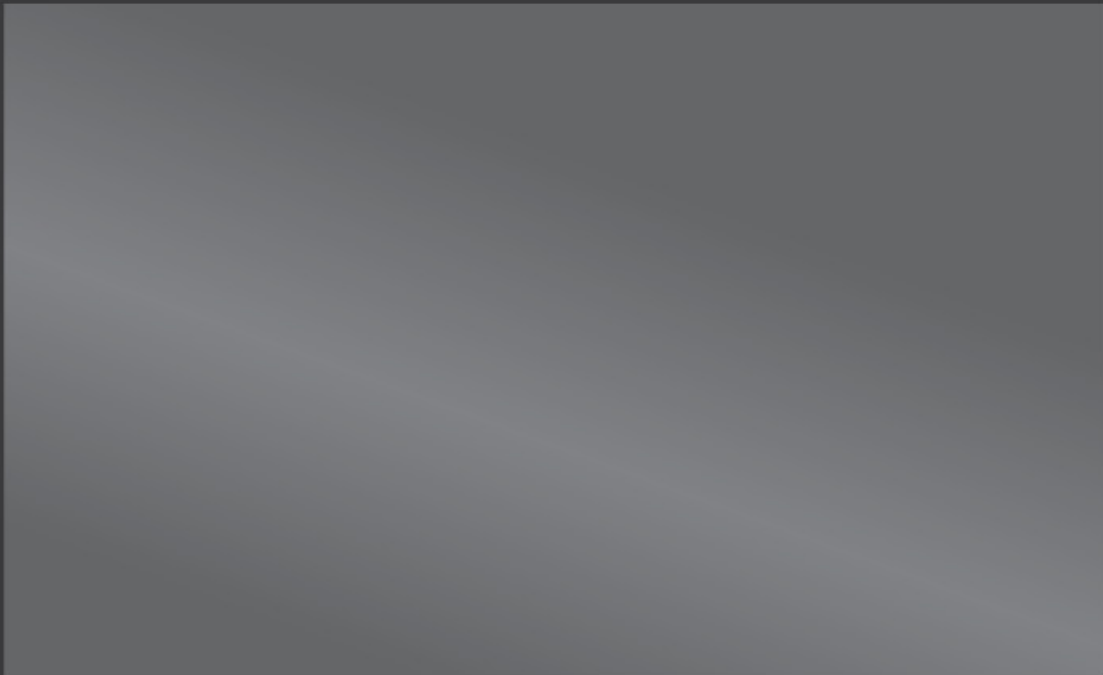
3M FX ST Automotive Window Films